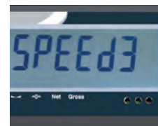
Function: Speed converter