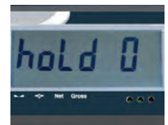
Function: Hold (4 modes)